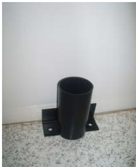
Storage stand for bollard when not in use