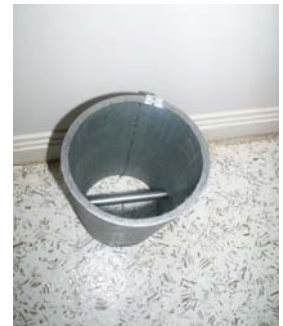
Locking Sleeve which is epoxyed into core drilled hole. Bollard locks onto bar.